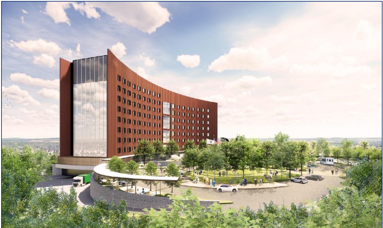
Massachusetts Veterans Home at Holyoke Rendering | Payette Architects

The deadline for RFP submissions is November 6, 2024 at 5:00PM EST.