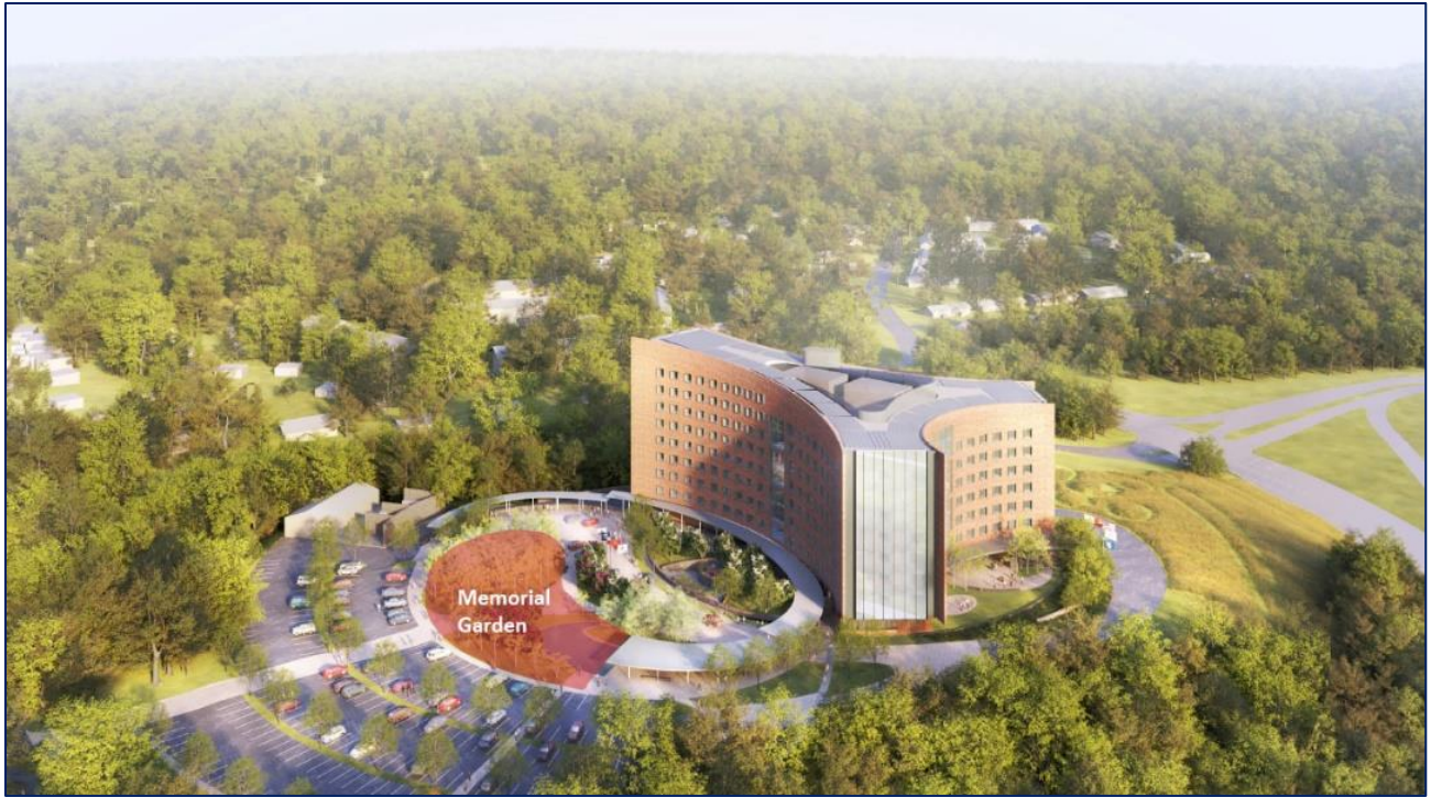
Location Map Rendering for Memorial Site at MA Veterans Home at Holyoke | Payette Architects

The memorial may be conceived and integrated within the memorial garden, memorial pond, green buffer located along the eastern edge of the site, and/or the pavilion space adjacent to the memorial garden/pond. Please see the location map and sit plan for additional information.