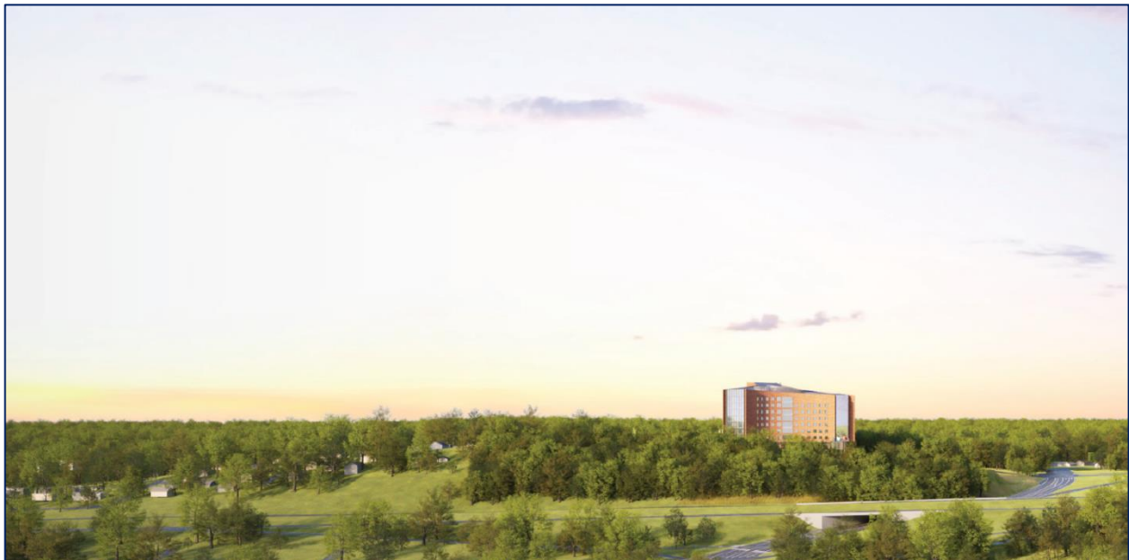
Massachusetts Veterans Home at Holyoke Rendering

Please disclose any conflicts of interest, in writing, to the review committee who will consider the nature of the respondent's responsibilities and the degree of potential or apparent conflict in deciding the course of action that the respondent needs to take to remedy the conflict of interest. Examples of potential conflicts of interest include, but are not limited to: a relation through kinship to a member of the Review Committee, etc.