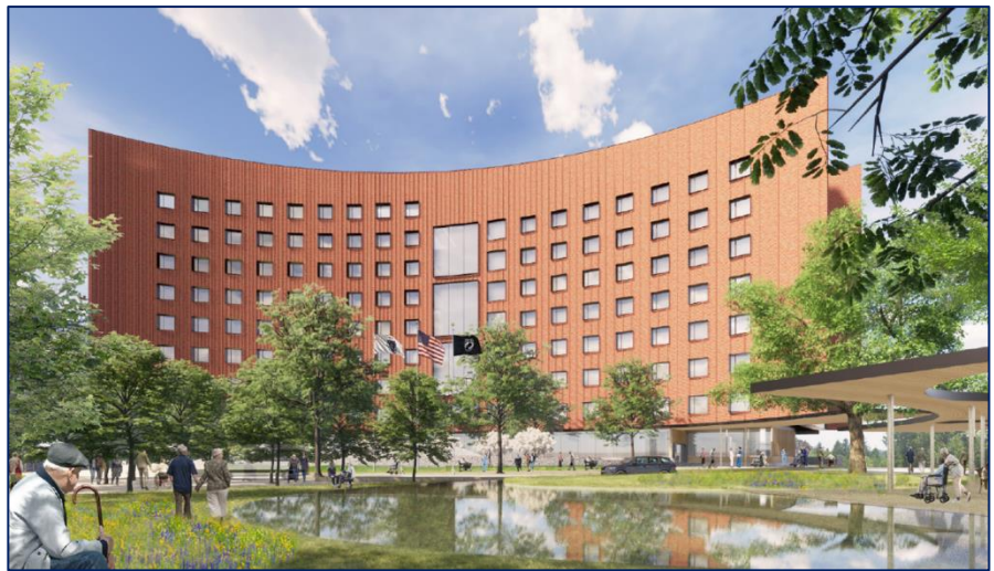
Massachusetts Veterans Home at Holyoke Rendering | Payette Architects

The new, 350,000 +/- GSF building is currently under construction, and will act as a long term care facility for 234 full time residents. It will also have an adult day program capable of serving 40-50 veterans from the community. The Veterans Home will deliver services and programs more effectively, meeting current and future quality of life standards for veterans.